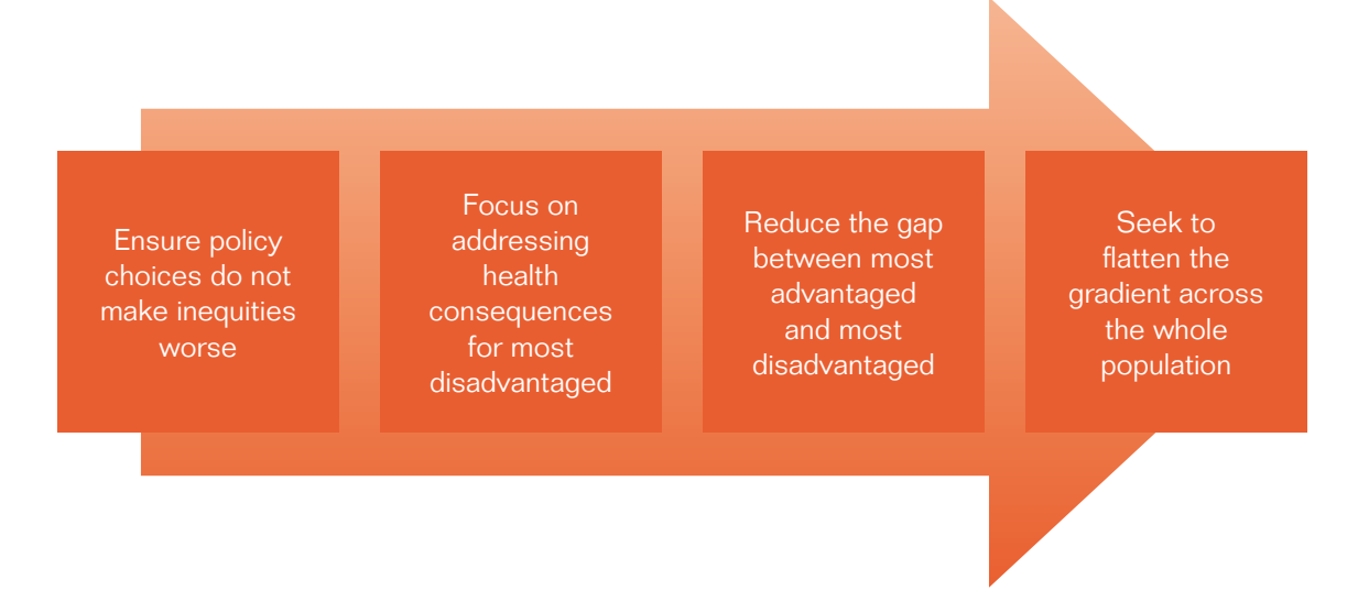
Fig. 3. Incremental approach to reducing inequities

It is not just the most disadvantaged who suffer a disproportionate burden from tobacco use. A social gradient exists, whereby each socioeconomic group suffers relatively more tobacco-related harm than the next group above them in the social spectrum. Addressing gaps between groups and reducing the social gradient requires a combination of universal policies and additional measures according to the different levels of need involved.