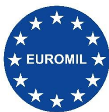
European Organisation of Military Associations and Trade Unions (EUROMIL)