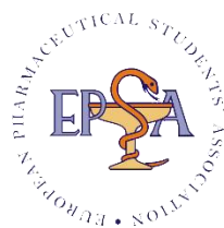
European Pharmaceutical Students' Association