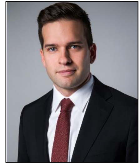
Gabriel Wikström, Minister for Health Care, Public Health and Sport