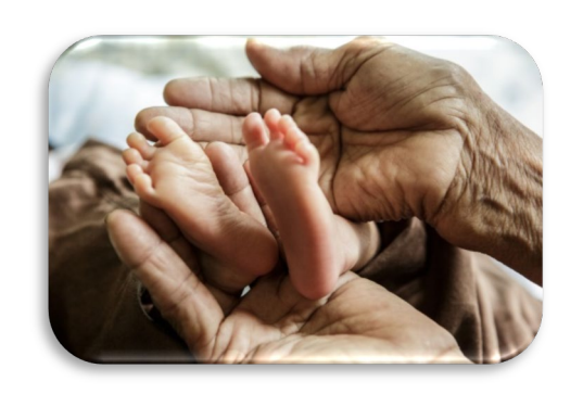
Health throughout the Life Course