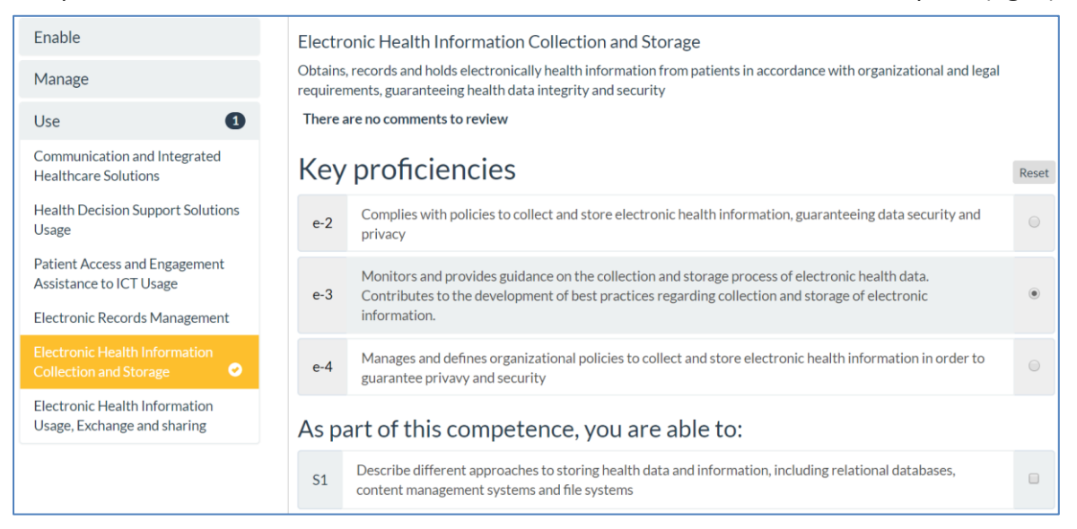
Figure 3: Selecting a competence in the online tool

An online tool will be used by health professionals to assess themselves against the competence framework in an exercise that should take 10-20 minutes to complete (fig. 3).