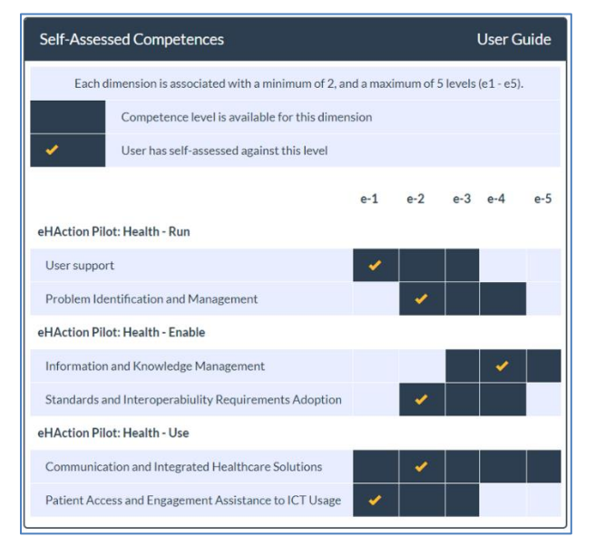
Figure 4: Participant profile summary report in the online tool

Each health professional will see a summary report of their selections on completion of the exercise (fig. 4).