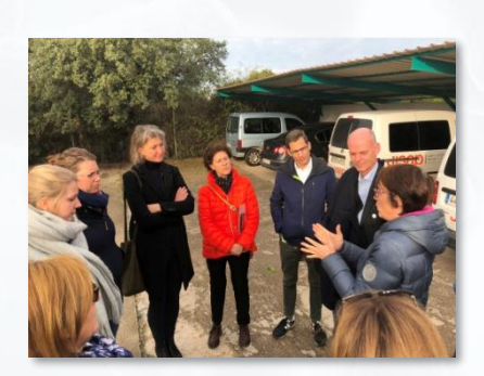
Why did we select these farms?