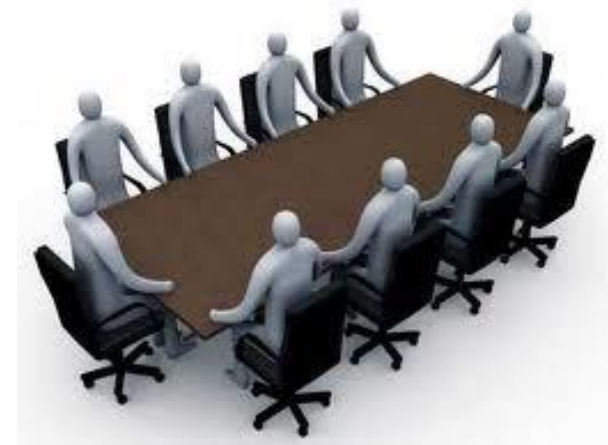
March 1999 Scientific Committee