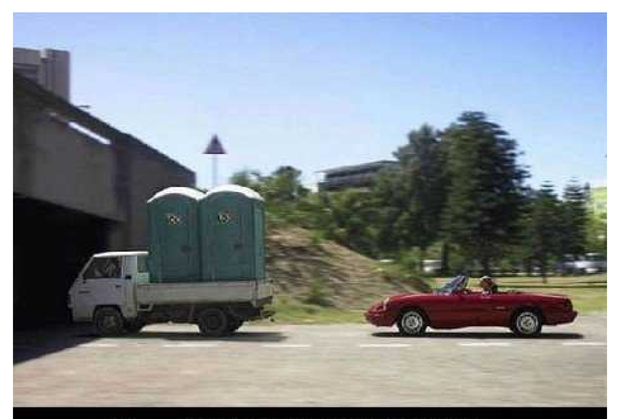
SO, ... HOWS YOUR DAY GOING?