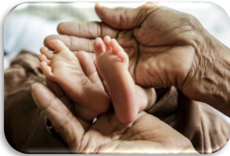
Health throughout the Life Course