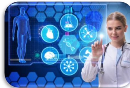
Tools, Technologies and Digital Solutions for Health and Care