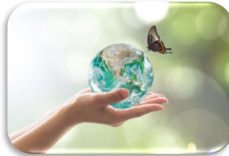
Environmental and Social Health Determinants