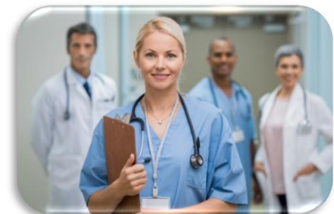
Health Care Systems