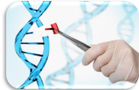
Non-communicable and Rare Diseases