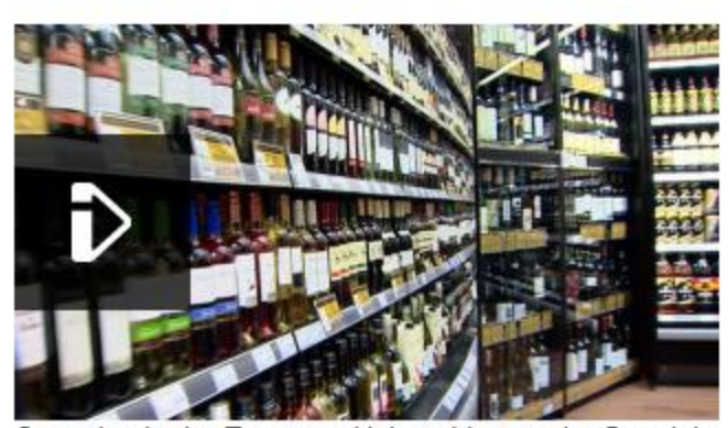
Countries in the European Union object to the Scottish government's minimum pricing for alcohol policy

Five EU countries have now raised concerns that the proposal may infringe free trade rules.