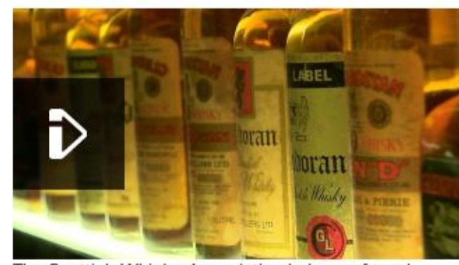
The Scottish Whisky Association lodges a formal complaint with the European Commission

The SWA said it had lodged a formal complaint to the European Commission over the legislation.