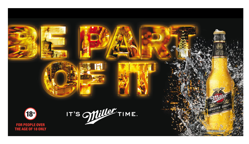
Figure A | Approximately 5% of billboard area (including the minimum exclusion zone) 'Miller red' used for responsibility message

Please ensure that the message is kept away from the main branding element within any given campaign. Wherever possible please try and use key icons along with the main message.