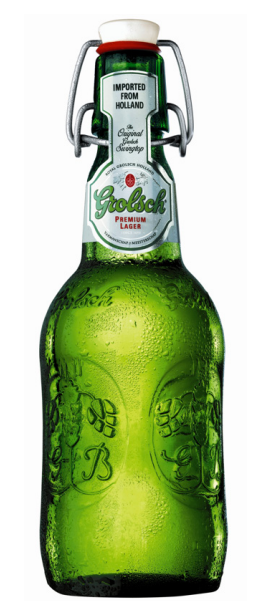
Figure A | Approximately 7.5% of total neck label area

On all labels it is recommended that the message be between 5-10% of the total label surface area. Figures A below shows a sample of a single label treatment. Please note that where there is a 'wrap-around' label, the message can be positioned outside the front 180° branding 'line-of-sight' area.