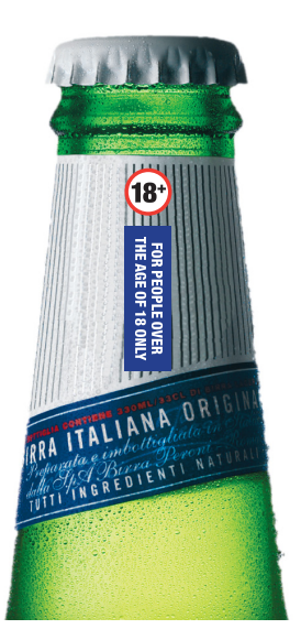
Figure C | Approximately 7% of total label area