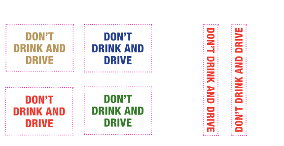
Figure C | Brand colour