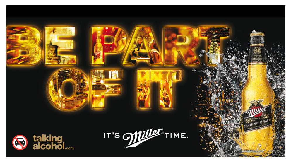
Figure B | Approximately 5% of billboard area (including the exclusion zone). See the 'talkingalcohol.com' guidelines for further details