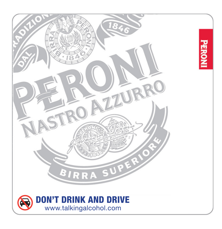
Figure A | Approximately 5% of surface area. Peroni Blue is used

*Brand colours are unique to each beer brand. Please see independent brand guidelines for choice of correct brand colours.