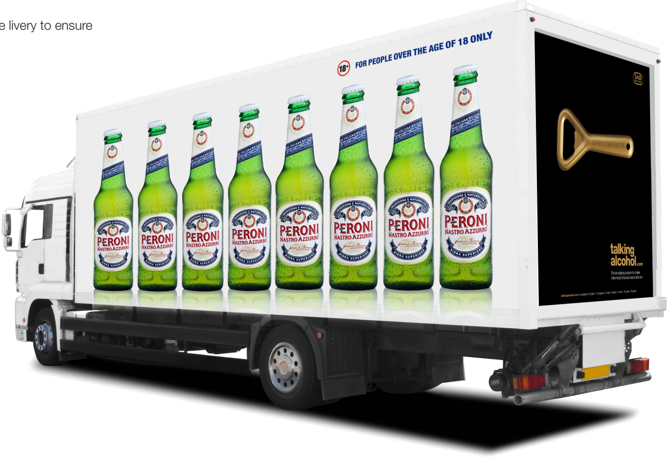
Figure A | Approximately 10% of the side surface. Peroni Blue is used on Livery

Messages must be prominently positioned on the livery to ensure maximum exposure.