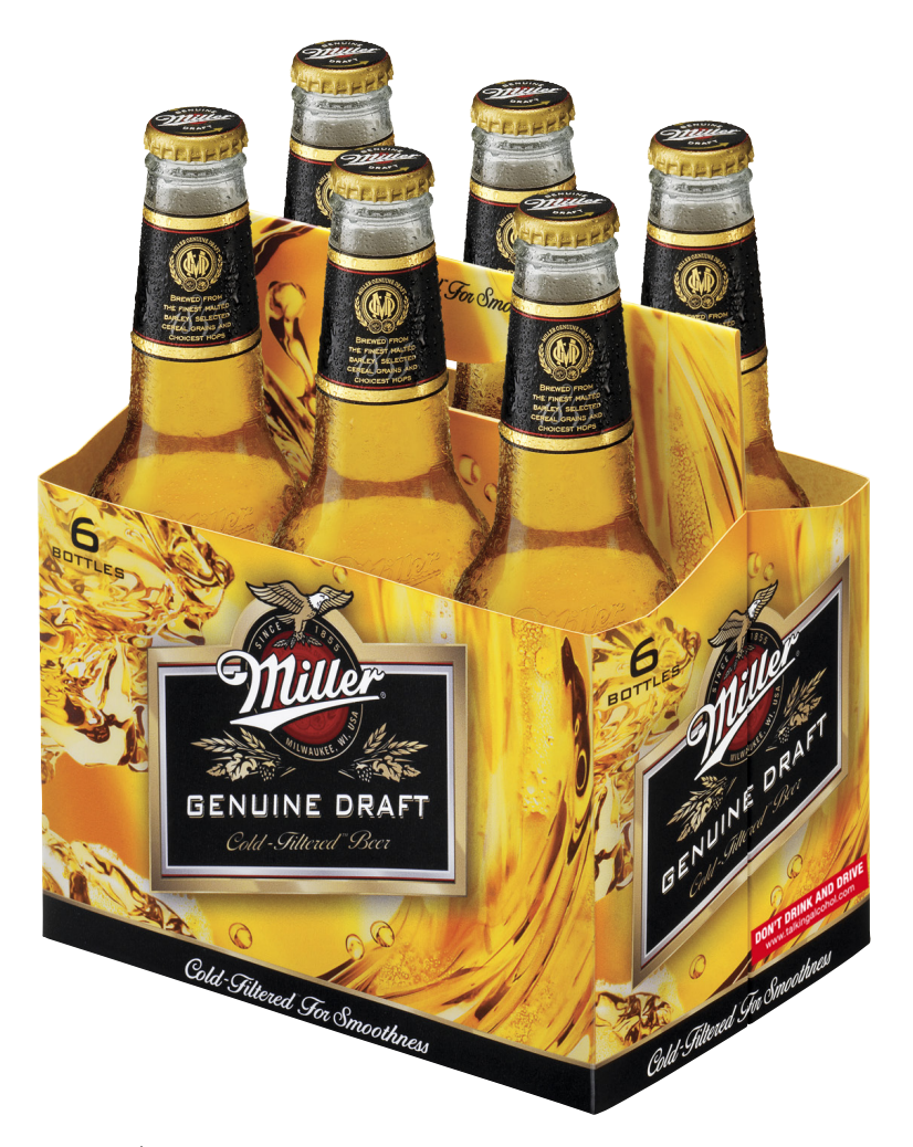
Figure A | Approximately 5% on two side areas

Where possible, if the brand packaging allows, use a horizontal application of the message.