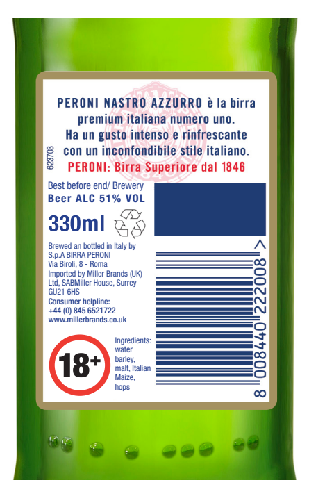
Figure B | Approximately 5% of total label area