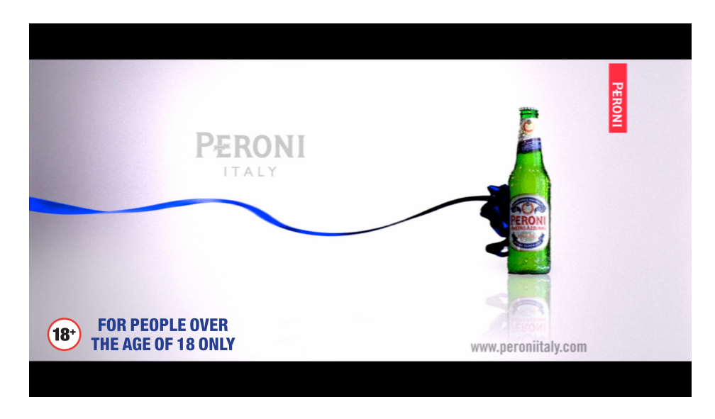
Figure A | Approximately 5% of screen area 'Peroni blue' is used for responsibility message

The message must be clearly visible at a minimum size of 5% of the screen area (see Figures A & B).