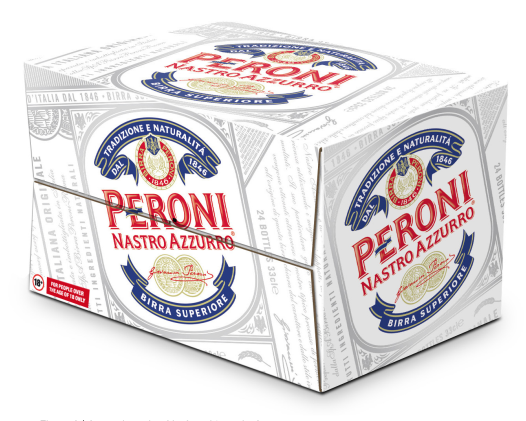
Figure A | Approximately 5% of total 'opening' area

Where possible, if the brand packaging allows, use a horizontal application of the message