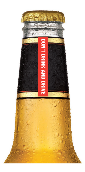
Figure A | Approximately 10% of total label area