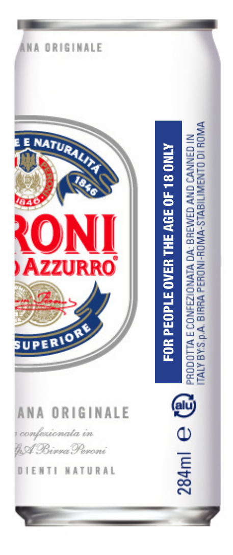
Figure A | Approximately 5% of total viewed area