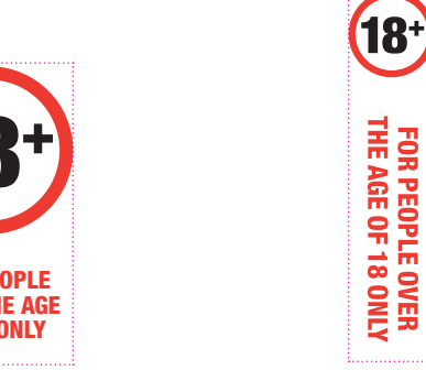
Figure E | Vertical relationship