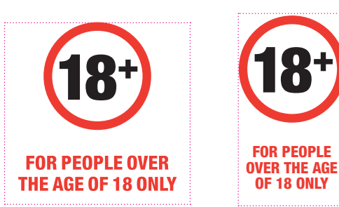
Figure C | Stacked relationship