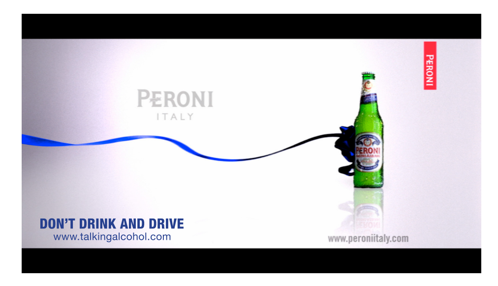
Figure B | Approximately 5% of screen area 'Peroni blue' is used for responsibility message