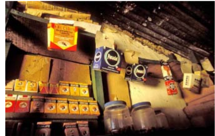
Local shop selling basic malaria medicines, Kisumu, Kenya.

Essential requirements for the delivery of correct diagnosis and treatment of malaria -> combination of public sector facilities and trained CHWs (Ethiopia, Zambia)