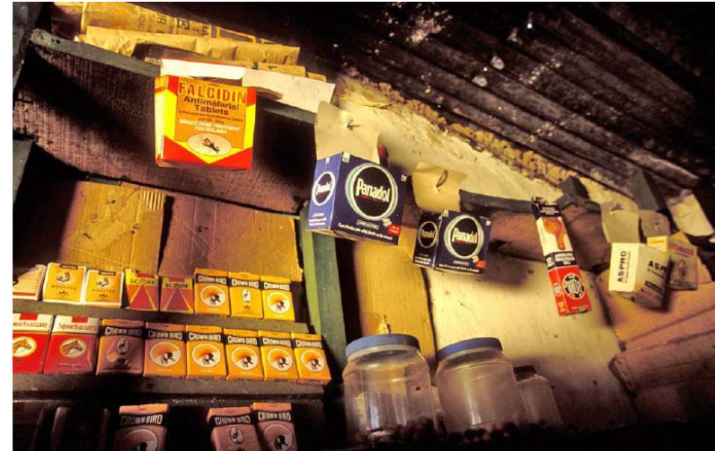
Local shop selling basic malaria medicines, Kilifi, Kenya.

Diverse and differs from country to country (influenced by political, historical and economic factors)