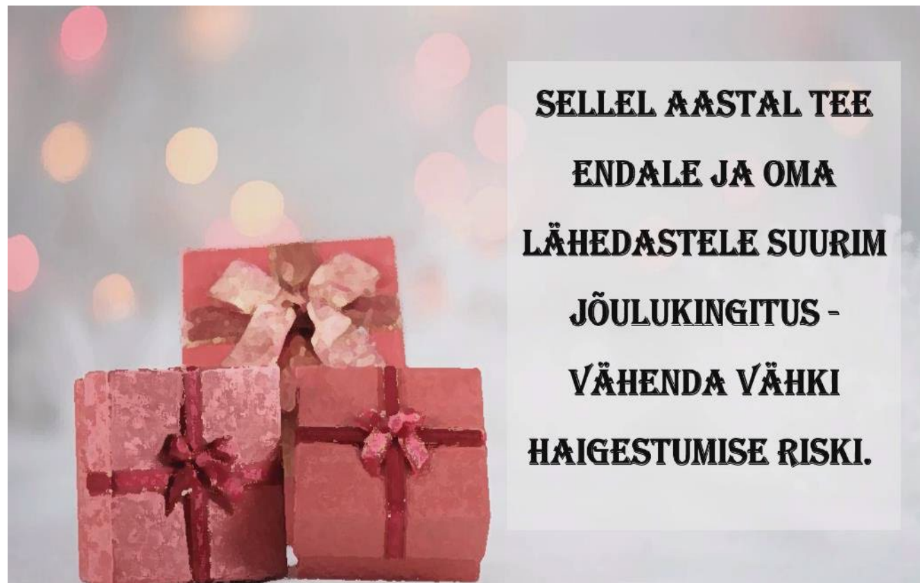
Screenhot of the Estonian video „Tee endale kingitus“ (Metsa et al., 2022).

RECOMMENDATION #3: Take action to be a healthy body weight