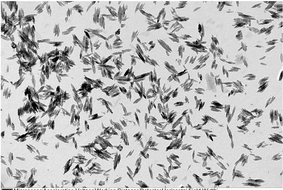
Microscope Accelerating Voltage Working Distance Detector Horizontal Field Width 1200EX II 80 kV - 2,4 µm - 500 nm-