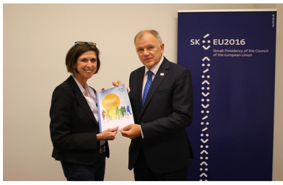
Informal Health Council, Bratislava, 3 Oct. 2016: formal hand-over of Benelux Secretariat General report to Commissioner Andriukaitis