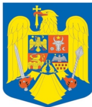
Ministry of Education

Partnership for a Strong Social Campaign