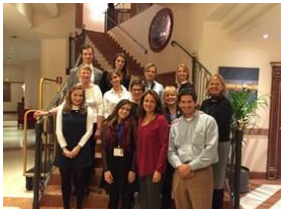
Pictured above: Attendees from the LCI NGO Summit in Brussels

The International Federation on Ageing (IFA) were quickly identified as key allies in the field of Life Course Vaccination. CoMO joined forces with the IFA to organise an NGO Summit in Brussels in November 2015 to establish a dialogue with European NGOs and to establish partnerships with organisations not traditionally associated with the meningitis world. CoMO sought to create such connections in order to ensure that LCI was promoted to the widest audience possible. In June 2016, CoMO presented a poster (pictured above), at the IFA Global Conference as a part of our continued partnership on LCI.