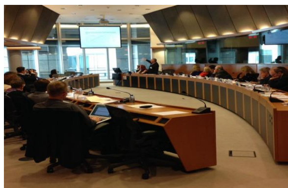
Pictured bottom: Delegates attend the European Parliamentary meeting