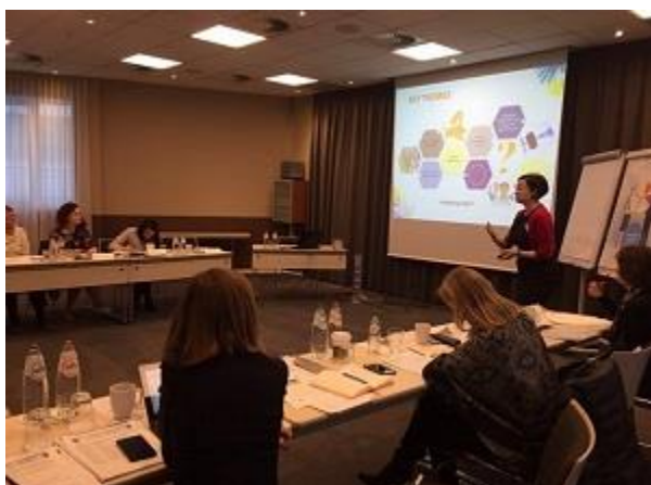
Pictured above: Topics of priority discussed at strategy workshop

Having established a committed number of organisations from different fields, CoMO and EIWH arranged a strategy workshop to draw together the discussions from the European Parliamentary meeting and the EiP Policy Forum to produce a plan for the group to develop a strong resource base prior to the proposed formation of a formal coalition of those in attendance.