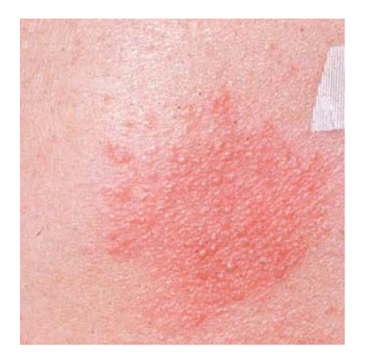
Fig. 3: An eczematous reaction after 72 hours indicates an allergy against the substance tested. This is not a "side-effect", but a clear diagnostic outcome.

Fig. 1: A 20 mg petrolatum patch test preparation containing the allergen (e.g.0.2 mg of the fragrance eugenol)