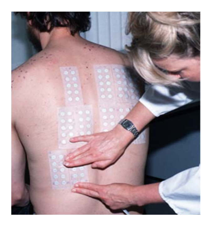
Fig. 2: ....is placed on the back of the patient

Fig. 3: An eczematous reaction after 72 hours indicates an allergy against the substance tested. This is not a "side-effect", but a clear diagnostic outcome.