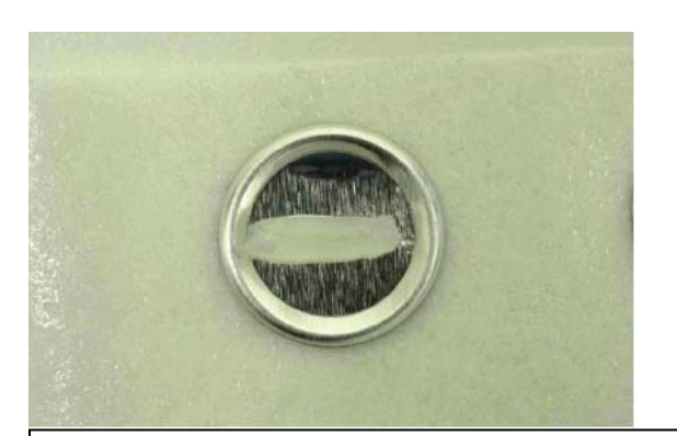
Fig. 1: A 20 mg petrolatum patch test preparation containing the allergen (e.g.0.2 mg of the fragrance eugenol)

The chemical the individual is sensitized to is identified by the "patch test". (fig 1 - 3). In patch testing, a chemical suspected to cause contact allergy, e.g. a fragrance or a rubber compound, is applied in minute quantities on the skin.