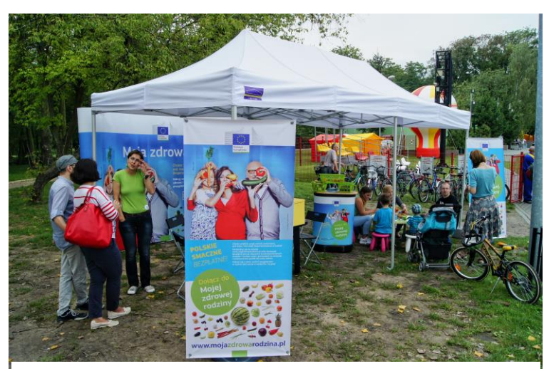
Event in Inowrocław, Poland. 31 August 2014.

During the summer months prior to the launch events, the project team organised 14 promotional events in the four participating regions to raise awareness of the project among its target collect groups and registrations. In most cases local outdoor events events related to healthy eating and lifestyle taking place in main towns and cities were chosen to build up a stand with an information desk and kid's corner. The staff project in T-shirts actively encouraged passers-