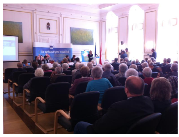
Launching event in Miskolc, Hungary. 23 September 2014.

The joint launch events on September 2014 Rzeszów and Toruń in Poland and Debrecen and Miskolc in Hungary had two distinct parts: an "official" opening session attended by officials, stakeholders and the media in the morning and a public event in the afternoon with a "My healthy family" stand. People who visited the tent could taste local and seasonal fruit and sign up to the project. Among others the "official" session was attended by local officials, e.g. the deputy major and representatives of the health department of the City of