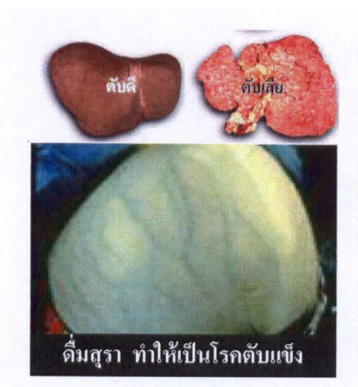
แบบที่ ๑ "คื่มสุรา ทำให้เป็นโรคตับแข็ง"

No less than 30% of the total surface area of the package