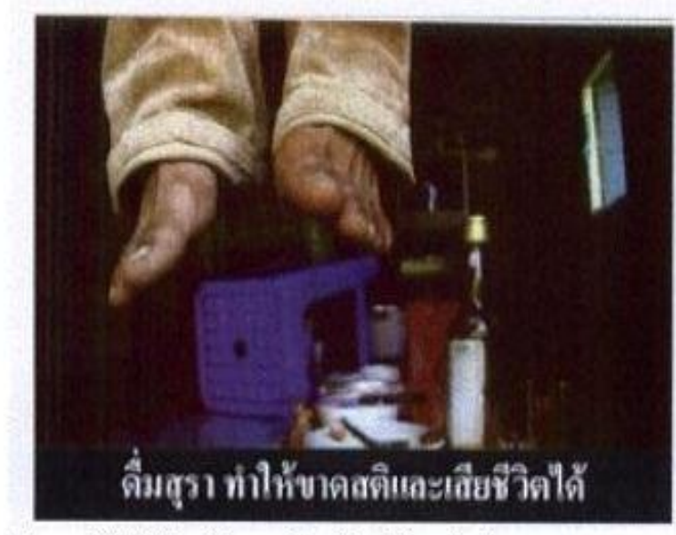
Type 3 "Drinking alcohol leads to unconsciousness and even death"