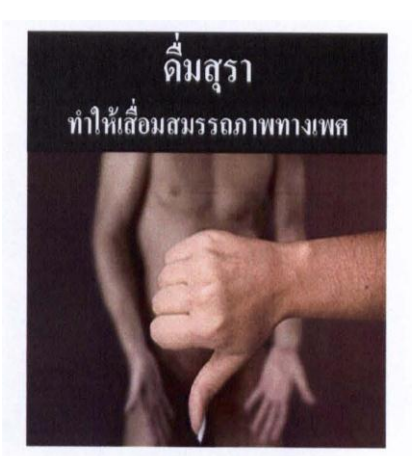
แบบที่ ๔ "คื่มสุรา ทำให้เสื่อมสมรรถภาพทางเพศ"