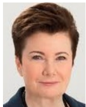
Ms Hanna Gronkiewicz-Waltz