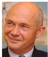
Mr Pascal Lamy

Healthy oceans, seas, coastal and inland waters