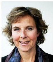
Ms Connie Hedegaard

Adaptation to climate change, including societal transformation