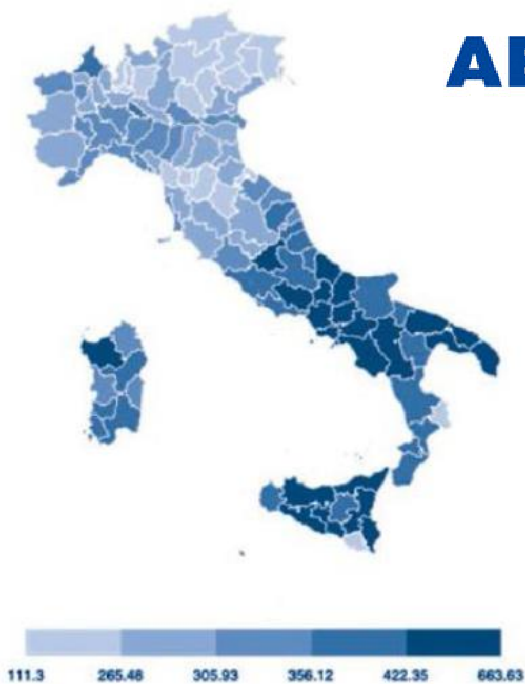
Caesarean section rates in Italy by province, age-standardised, per 1000 women (2011).