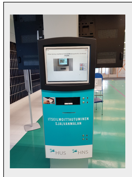
Textbox 8: Accessibility of digital services for visually impaired

Helsinki University Hospital has utilised check-in machines (see above picture) for the patient registration for some years. When the patient enters the hospital he/she shows the barcode of his/her ID card or driver's license to the reader of the machine. His/her visit is then registered and the check-in machine gives instructions on screen or prints a paper where to go within the hospital premises. The Association for Visually Impaired was, however, not happy with the machines. They claimed that the touch-screen of the machine is unusable for a person with visual problems and that a printed paper map is useless for the blind. The Association also noted that the EU Directive 2016/2102 on the accessibility of the websites and mobile applications of public sector bodies requires that public authorities ensure their access to all digital services that the hospital provides.