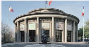
CESE Palais Iena Paris

3 rd and 4 th February 2022 The European Meetings of the French National Cancer Institute (INCa)